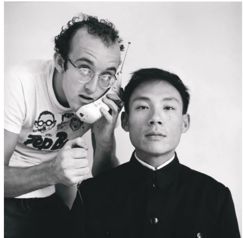
Tseng Kwong Chi | Keith Haring and Tseng Kwong Chi , 1986

In 1990, Tseng died at age 39 from complications related to the AIDS virus, leaving an enduring body of work that engages major photographic traditions — the tourist snapshot, portraiture, the Sublime tradition of landscape photography, documentary and performance. Tseng’s photographs have been exhibited widely in international exhibitions and are in numerous prestigious major public museums and private collections all over the world.