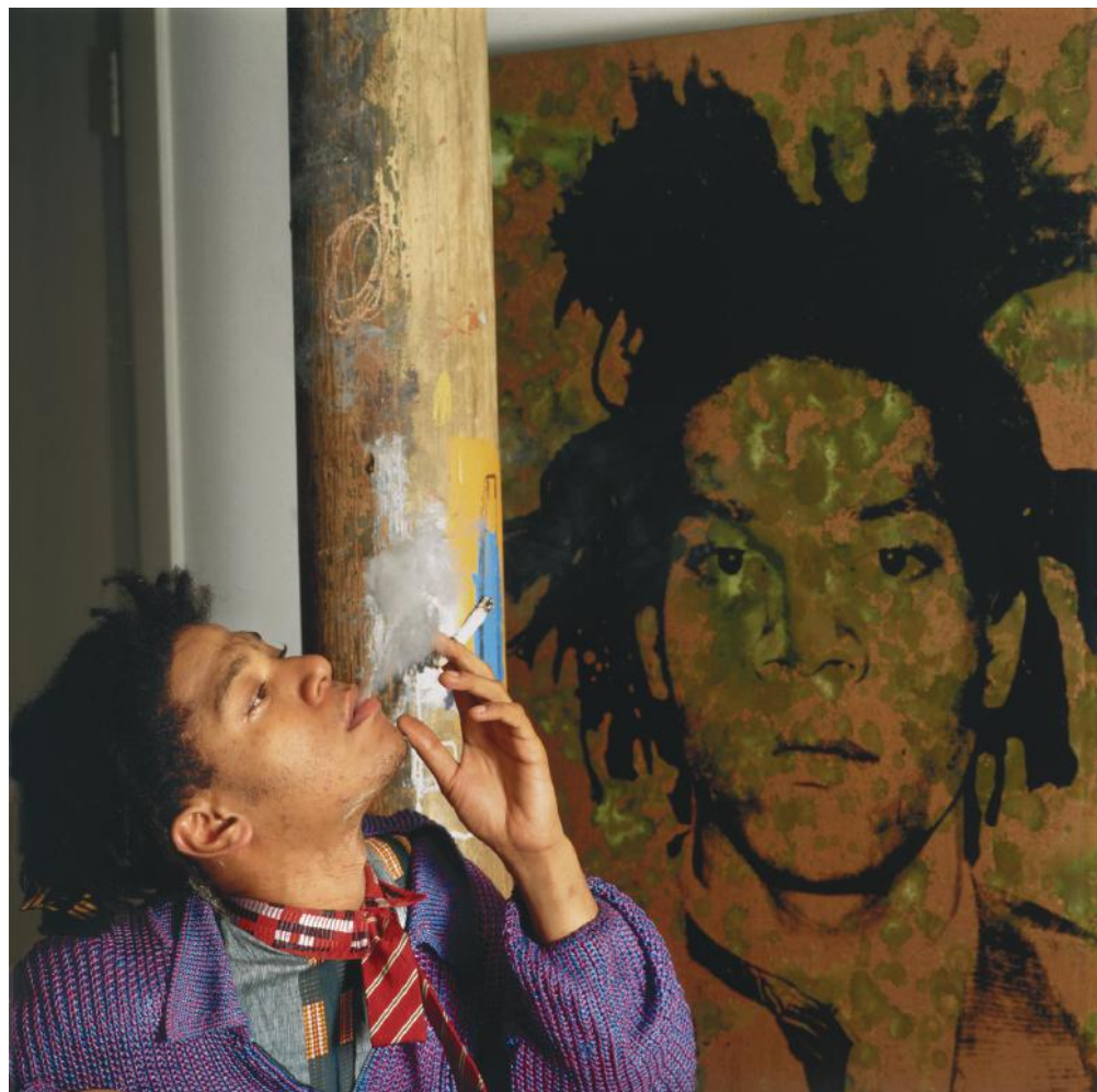
Jean-Michel Basquiat, New York, 1987